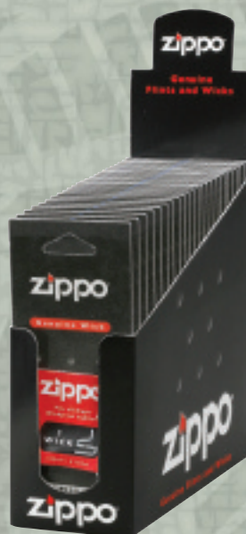
No. 2425 Wick Cards 24 cards per display box; 24 boxes per master carton

For optimum performance of every Zippo windproof lighter, we recommend genuine Zippo flints and wicks.