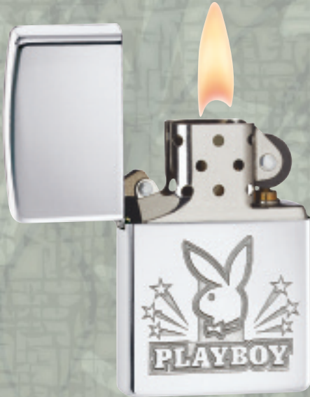
No. 24706 High Polish Chrome

© 2009 Playboy. PLAYBOY and Rabbit Head Design are marks of Playboy and used under license by Zippo Manufacturing Company.