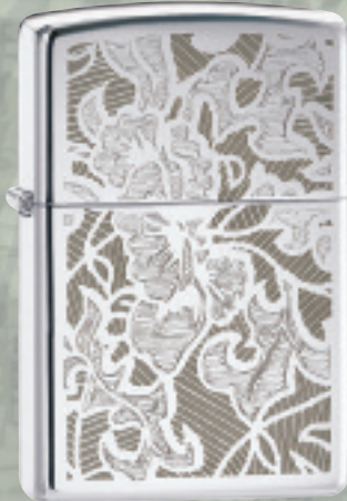
No. 24700 High Polish Chrome

Dual engraving processes combine to create a subtle blending of contrast in these two lighters.