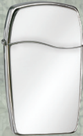
No. 30039 High Polish Chrome

Zippo BLU. The premium butane gas lighter with everything you expect from Zippo . . .