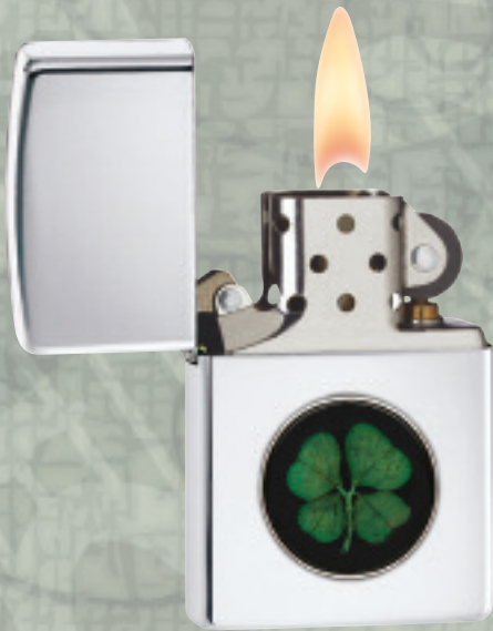
No. 24667 High Polish Chrome

For centuries, the four-leaf clover has been a universally accepted symbol of good fortune. Finding an elusive four-leaf clover is considered an omen of good luck . . . think how lucky, then, to find two on the same page. Zippo ups the odds of good fortune with a genuine four-leaf clover encased in an epoxy domed emblem. The authentic four-leaf clover is gently centered on the black background of a die-struck brass emblem, then flooded with clear epoxy to protect it, and mounted on a gleaming high polish chrome Zippo lighter.