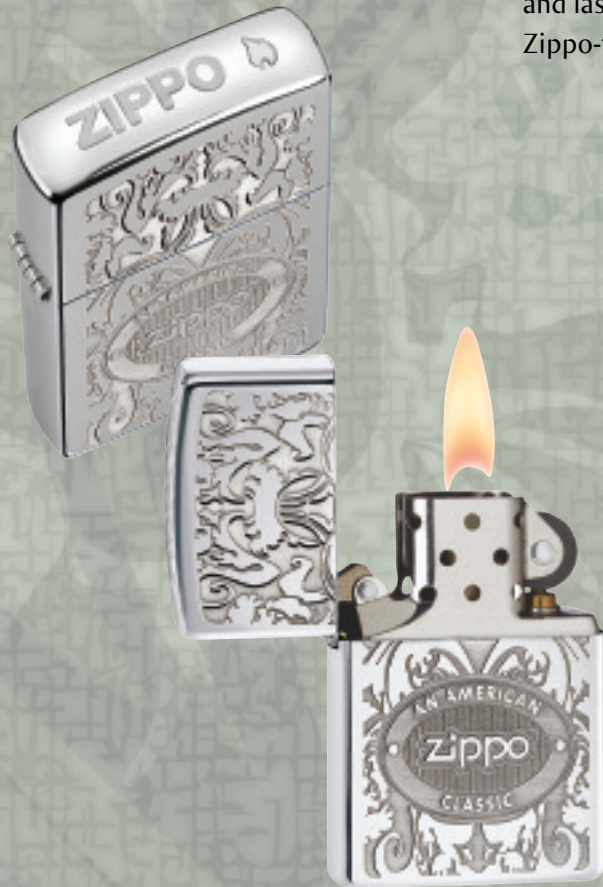
No. 24751 High Polish Chrome

A distinctive crown-stamped lid complements the polished radiance and lasting durability of this Zippo-themed lighter.