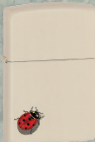
No. 24675 Cream Matte