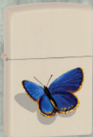
No. 24676 Cream Matte