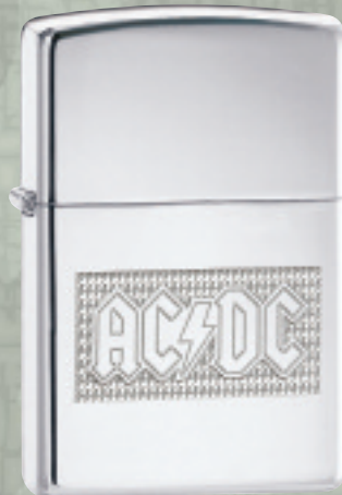
No. 24705 High Polish Chrome

AC/DC design illustrates Zippo's Double Lustre process to contrast multi-dimensional highlights on high polish chrome.