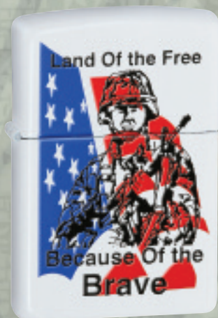
No. 24739 White Matte