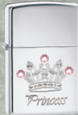
No. 24743 High Polish Chrome

Made with CRYSTAL LIZET ™ SWAROVSKI ELEMENTS