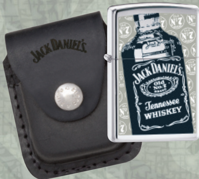
No. 24707 High Polish Chrome

Zippo puts an intriguing spin on classic brushed chrome. The front and reverse surfaces are vertical brushed chrome, but the outside edge surfaces are black matte. So is it brushed chrome or black matte? Both . . . it's Framed, a hot new look for an old favorite.