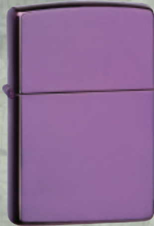
No. 24747 Abyss

Classic chrome plated lighters are bonded with a micro thin, scratch resistant coating to achieve a rich, luminous finish. Deep purple Abyss, with or without Zippo logo, supplements Zippo's vibrant palette of colorful finishes.