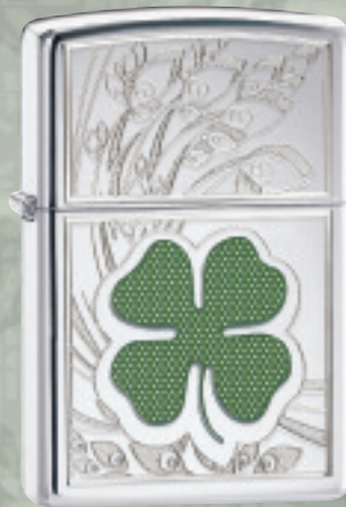
No. 24699 High Polish Chrome

Fortunately, these good luck charms won't be hard to find – just contact your Zippo representative to order.