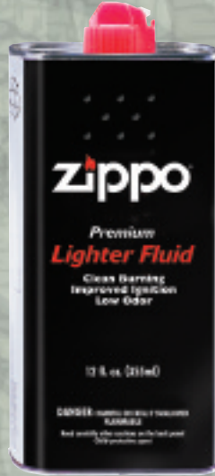
No.3165 Lighter Fluid 12 oz. (shipping carton of 24)

For optimum performance of every Zippo windproof lighter, we recommend the use of only genuine Zippo fluid, flints, and wicks. For optimum performance of every Zippo BLU butane lighter, we recommend genuine Zippo premium butane gas and flints. For all Zippo multipurpose lighters, we recommend genuine Zippo premium butane gas.