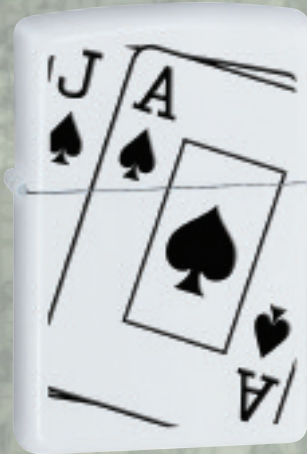
No. 24696 White Matte