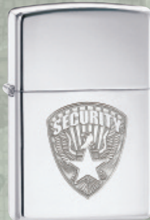
No. 24703 High Polish Chrome

Innovative Double Lustre engraving produces a multi-level image on gleaming high polish chrome. The design is etched, then selectively etched even deeper to achieve the look of a multi-dimensional emblem directly on the surface of the lighter.