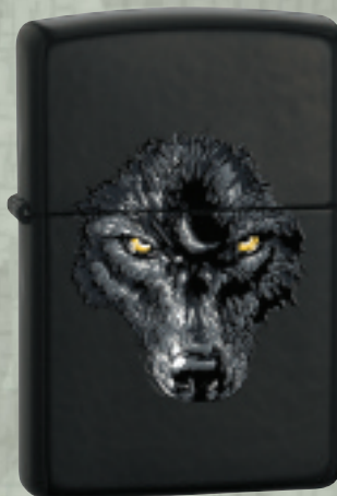
No. 24698 Licorice