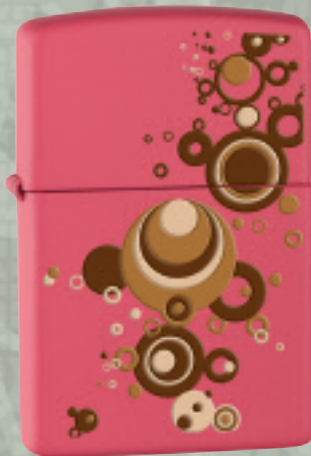
No. 24697 Carnation Matte