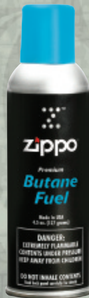
No.3800 Butane Fuel 4.5 oz. (shipping carton of 48 with 8 innerpacks of 6)