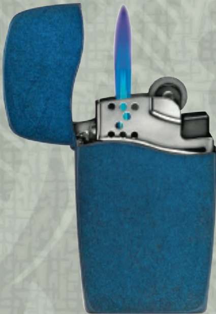
No. 30035 BLU2 with standard high polish chrome shroud