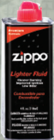
No.3141 Lighter Fluid 4 oz. (shipping carton of 24)