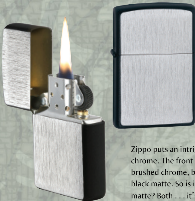
No. 24752 Framed Chrome

Zippo puts an intriguing spin on classic brushed chrome. The front and reverse surfaces are vertical brushed chrome, but the outside edge surfaces are black matte. So is it brushed chrome or black matte? Both . . . it's Framed, a hot new look for an old favorite.