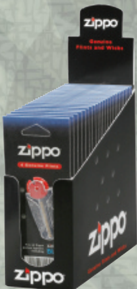
No. 2406N Flint Cards 24 cards per display box; 24 boxes per master carton

Zippo flints fit all Zippo windproof lighters and Zippo BLU lighters.