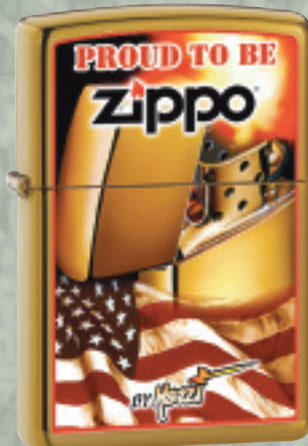
No. 24746 Harvest Bronze