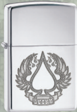
No. 24704 High Polish Chrome