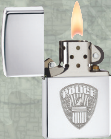
No. 24702 High Polish Chrome

Innovative Double Lustre engraving produces a multi-level image on gleaming high polish chrome. The design is etched, then selectively etched even deeper to achieve the look of a multi-dimensional emblem directly on the surface of the lighter.