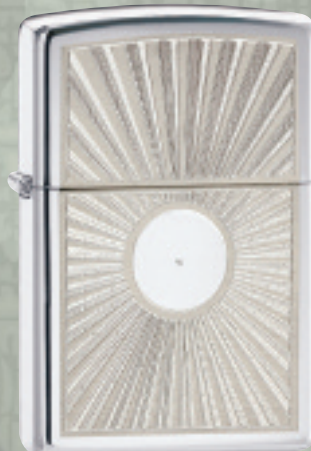
No. 24674 High Polish Chrome

Dual engraving processes combine to create a subtle blending of contrast in these two lighters.