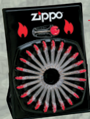
No. 2406C Six Flint Dispenser 24 per Display Card

For optimum performance of every Zippo windproof lighter, we recommend genuine Zippo flints and wicks.