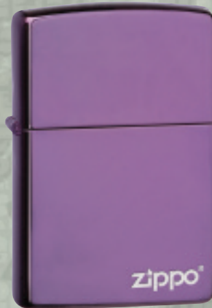
No. 24747ZL Abyss w/ Zippo Logo

Classic chrome plated lighters are bonded with a micro thin, scratch resistant coating to achieve a rich, luminous finish. Deep purple Abyss, with or without Zippo logo, supplements Zippo's vibrant palette of colorful finishes.